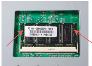
5. Accessing the SODIMM module from the open slot. (Top view)

6. After replacing the memory, perform Step 1-4 in reverse order to re-assemble the unit.