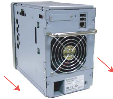
2. Sliding out the side panels. (Left-rear view)