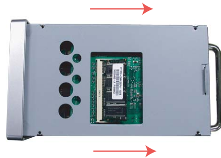
4. Taking off the top panel. (Top view)