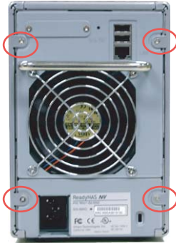
1. Taking off the 4 screws on the back as shown in the picture. (Rear view)

*Please use only qualified SODIMM memory. Check the ReadyNAS Compatibility List first.